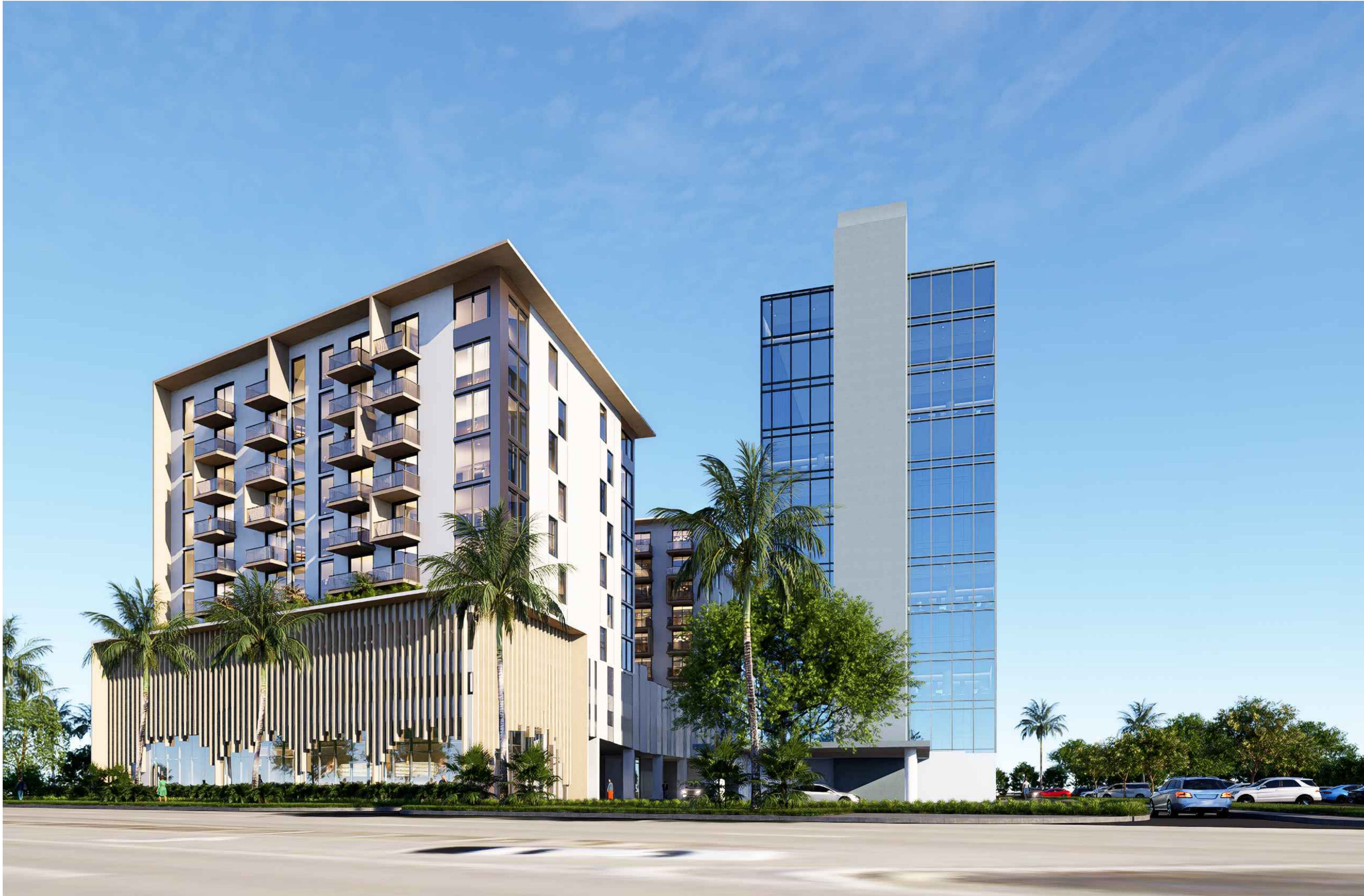
STREET VIEW OF THE SOUTH WEST CORNER OF THE BUILDING